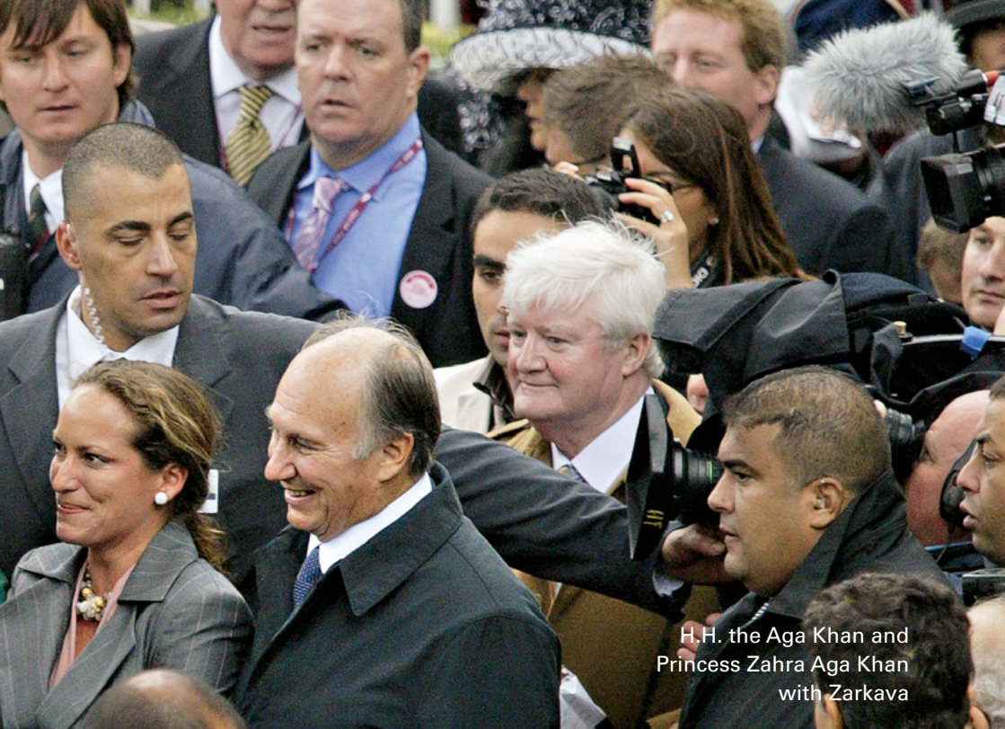
H.H. the Aga Khan and Princess Zahra Aga Khan with Zarkava