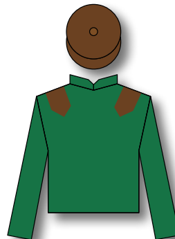
Princess Zahra Aga Khan