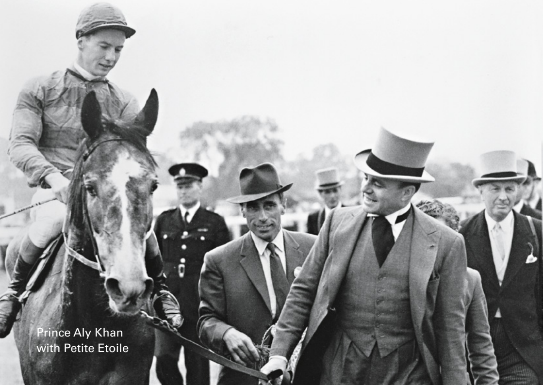
Prince Aly Khan with Petite Etoile