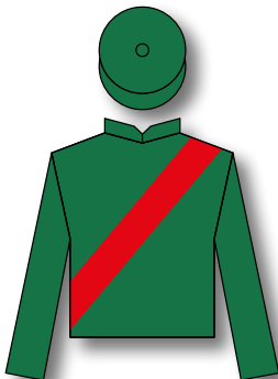
Prince Aly Khan in Great Britain (1936-56)