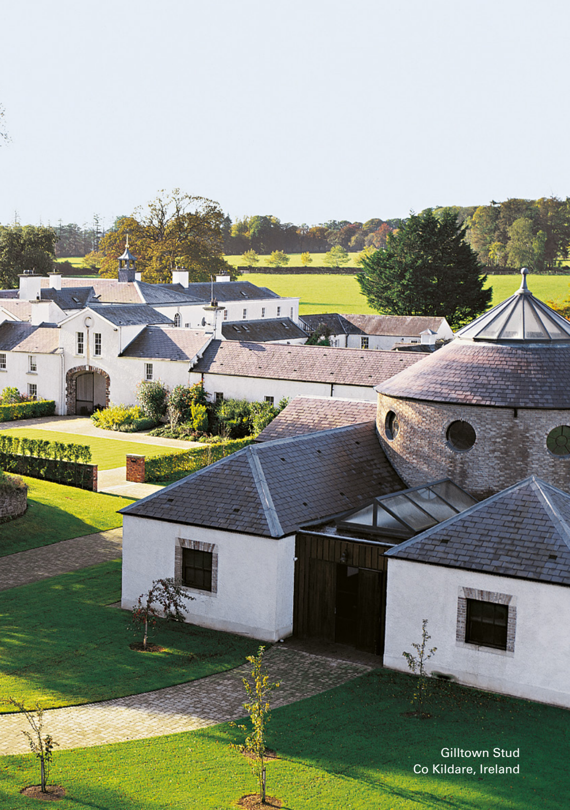
Gilltown Stud Co Kildare, Ireland