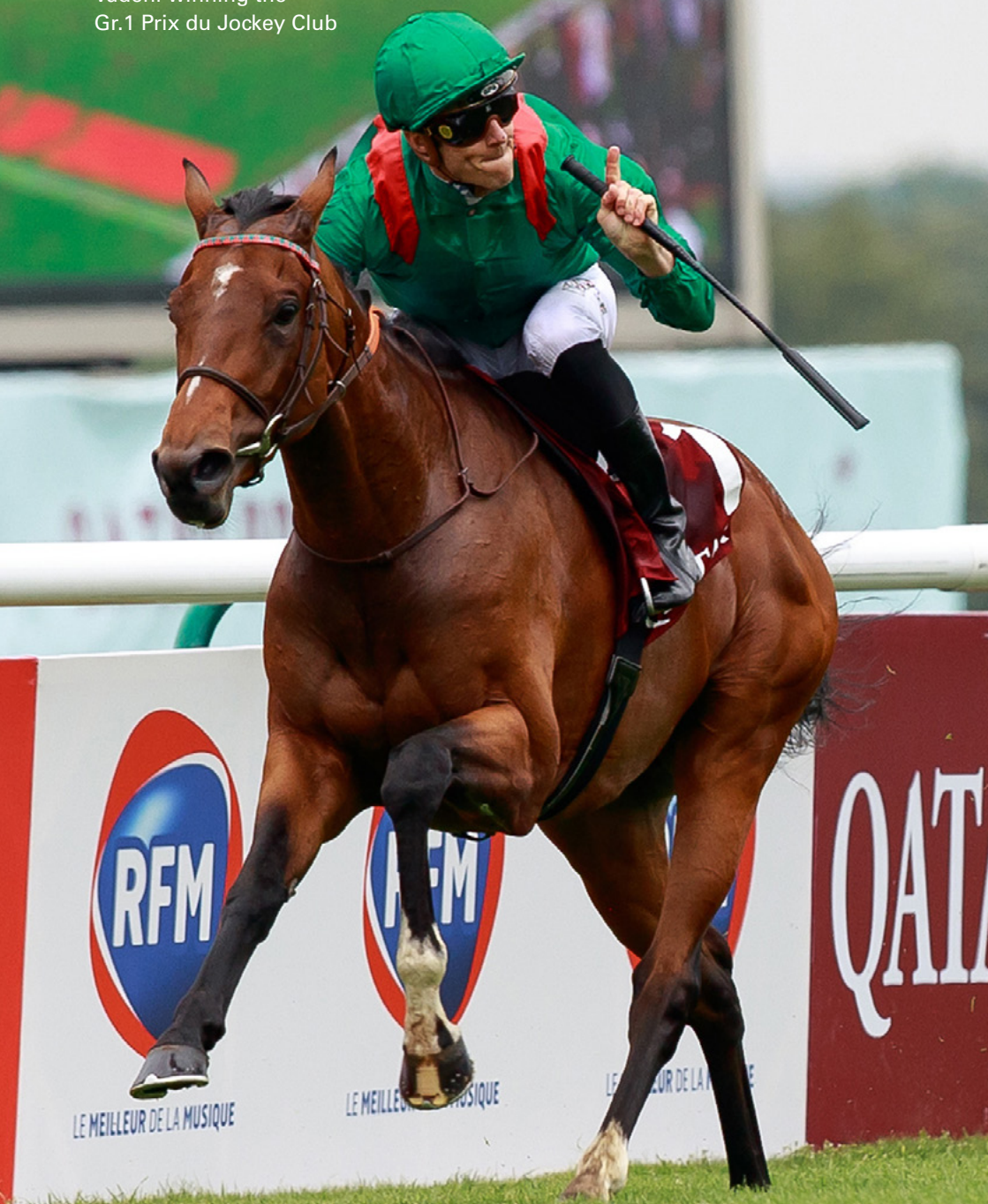
Vadeni winning the Gr.1 Prix du Jockey Club