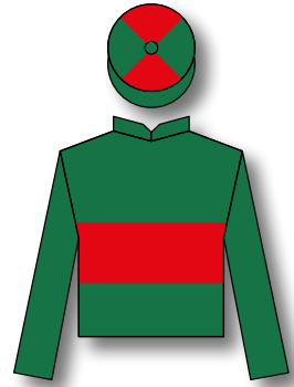
The late Aga Khan's first registered colours in India