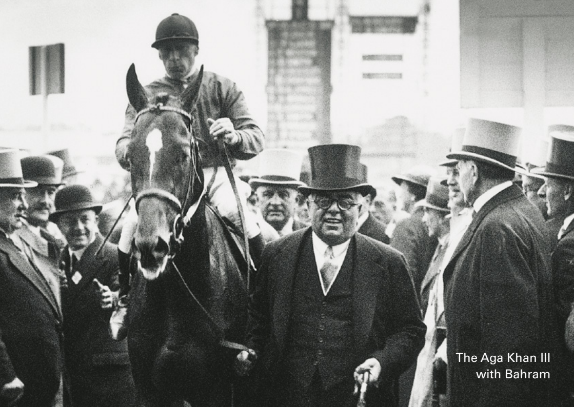
The Aga Khan III with Bahram