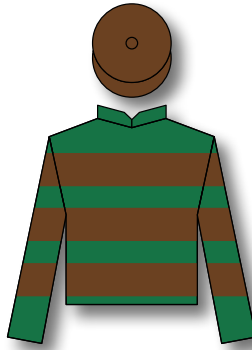
The late Aga Khan in Great Britain Prince Aly Khan in Great Britain (1957-60) Second colours of the present Aga Khan in Great Britain