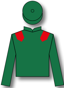
The late Aga Khan in France Prince Aly Khan in France (1957-60) The present Aga Khan