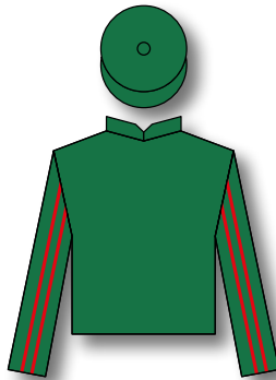
Prince Aly Khan in France (1932-56)