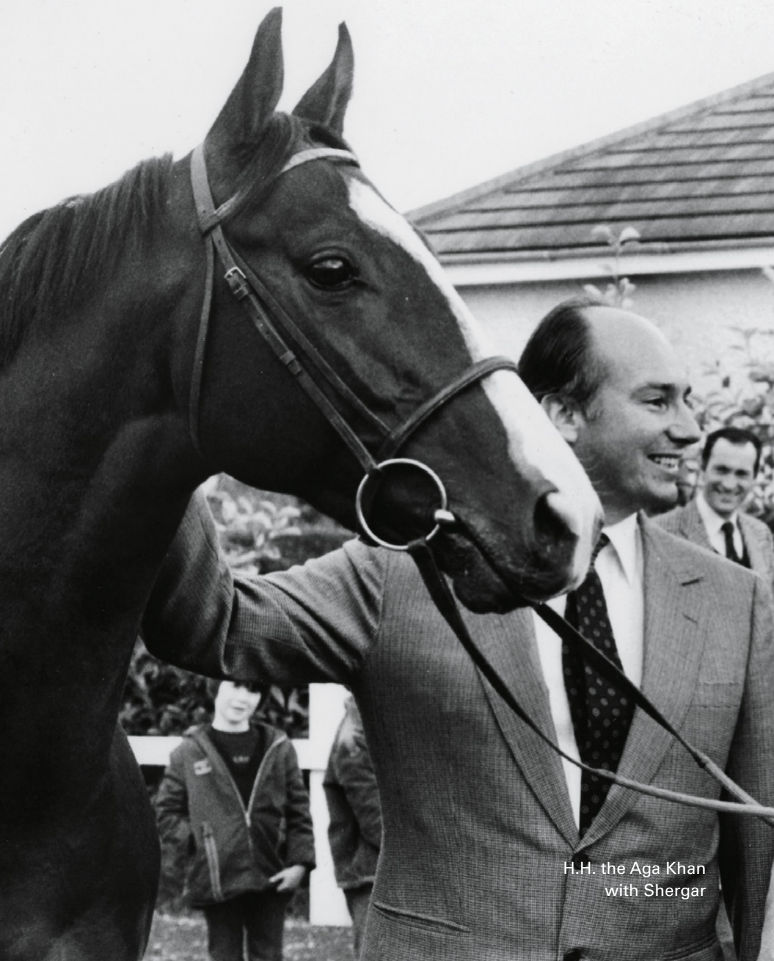
H.H. the Aga Khan with Shergar