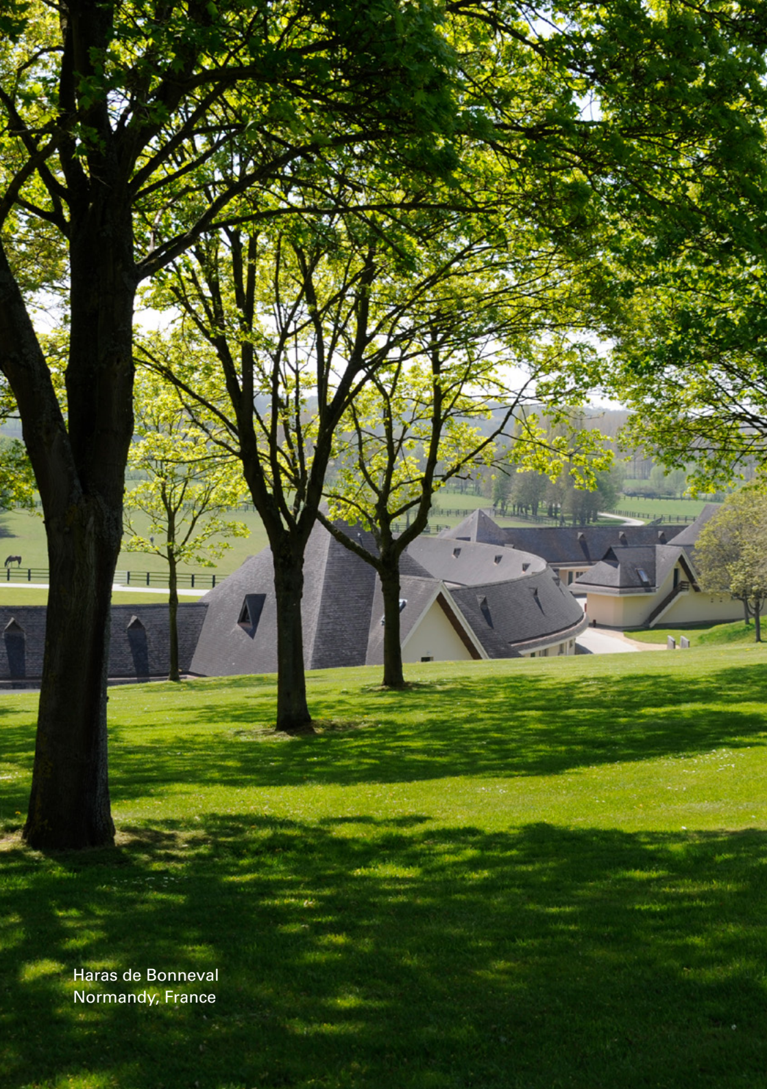
Haras de Bonneval Normandy, France